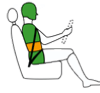
Side impact driver